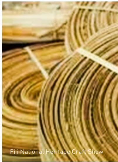
Fiji National Heritage Craft Show

Rau'ara, ara (Cook Islands), voivoi (Fiji), fiso, laupaogo, lau'ie (Samoa); lou'akau (Tonga); raufara (Tahiti, French Polynesia)