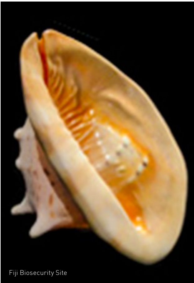
Fiji Biosecurity Site