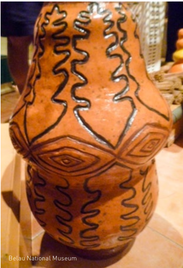
Belau National Museum