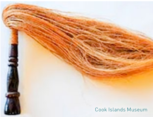
Cook Islands Museum