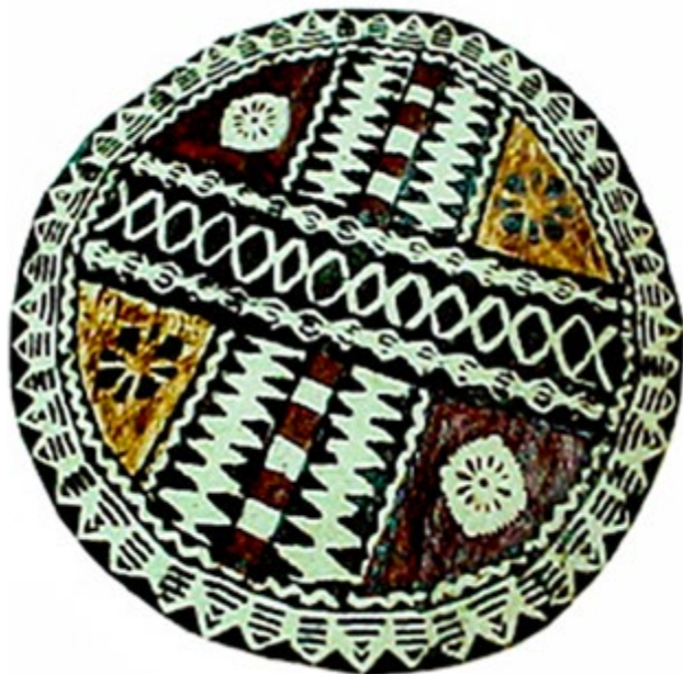
Na Korova Crafters