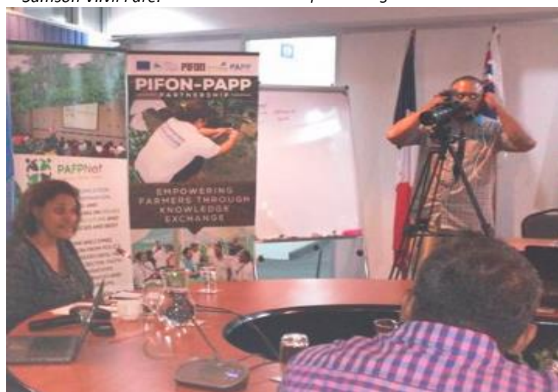
The Business Melanesia film crew was on-site filming the workshop discussions.