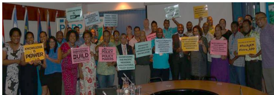
Caption: Participants pose during the pre-workshop Social Media Briefing.