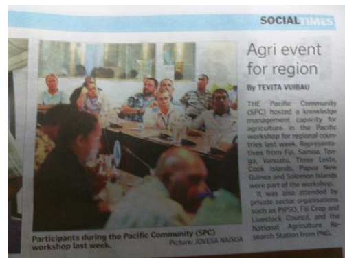
Two articles featured in the Saturday edition of the Fiji Times.