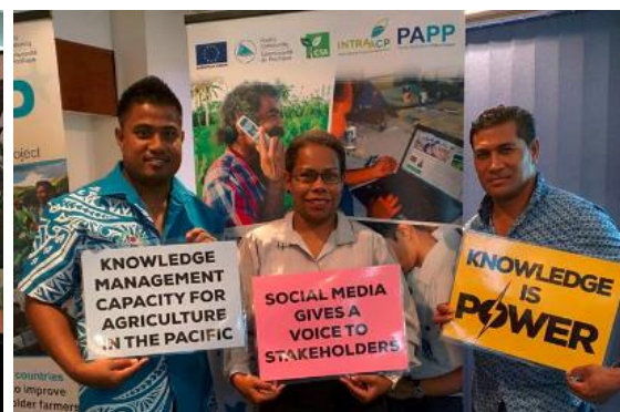
Participants showing off their Social Media skills in promoting the event on Facebook and Twitter