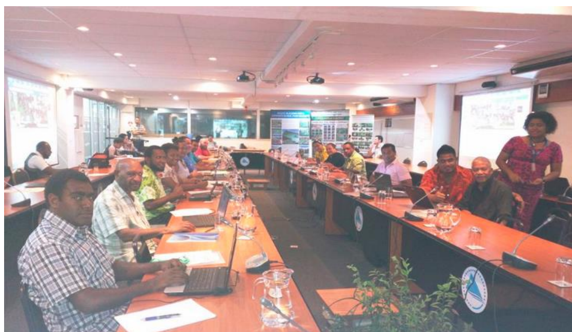
Caption: More than 30 people attended the Regional Workshop in Fiji.