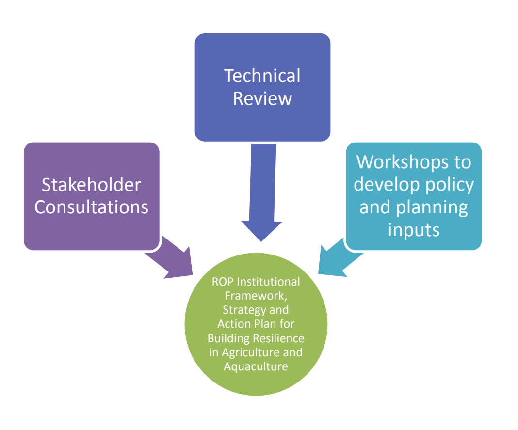
Diagram A: Inputs to the Institutional Framework, Strategy, and Action plan